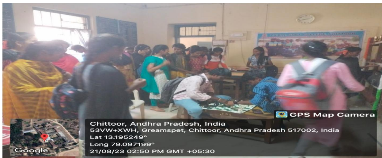
At College Gym